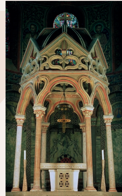
Monastery Maria Laach (Germany): the anterior two columns of the baldachin over the high altar made from lime deposit of the Eifel Aqueduct

Lacking other material, one used the aqueduct marble to beautify the romanesque architecture. Aqueduct marble was sold throughout Europe: all cathedrals along the “Hellweg” (from Duisburg via Paderborn to the Elbe), the cathedrals of Roskilde in Denmark and Canterbury in England and many churches in The Netherlands have columns, altars or grave stones of aqueduct marble.