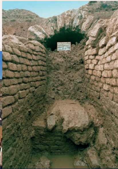
An archaeological discovery: the connection of two building sections in the course of the Eifel Aqueduct (Mechernich-Lessenich)

No aqueduct in the Roman Empire has been as thoroughly investigated as the Eifel Aqueduct to Cologne. In other aqueducts, it is rare to find as large a diversity of technical elements as here, near the Rhine.