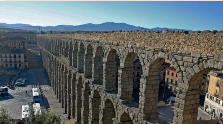
Aqueduct bridge in Segovia (Spain) – part of the Roman water system, but also a demonstration of Roman power?

It is as if the Roman engineers aimed to display the broad range of their capabilities through building the aqueduct. The construction of aqueduct bridges shows dimensions, seemingly surpassing the limits set by gravity. When determining the required slope of the duct along its course, a level of accuracy was reached which leads to doubts about the quality of modern measurements. All of this shows their thorough preparation and the accurate construction plan.