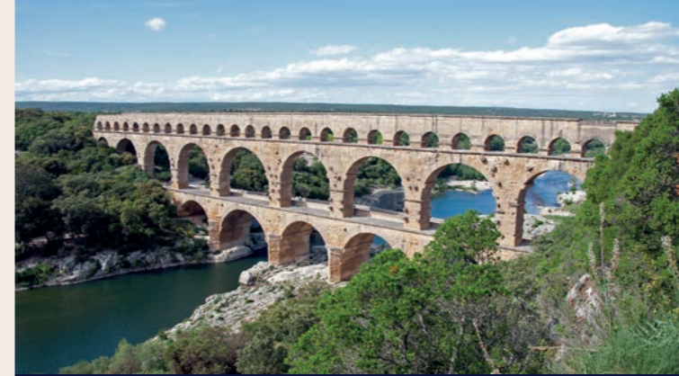
Nîmes (southern France): Pont du Gard

The exhibition uses photos, documents related to the excavations and models to illustrate the multitude of technical aspects of this overwhelming building.