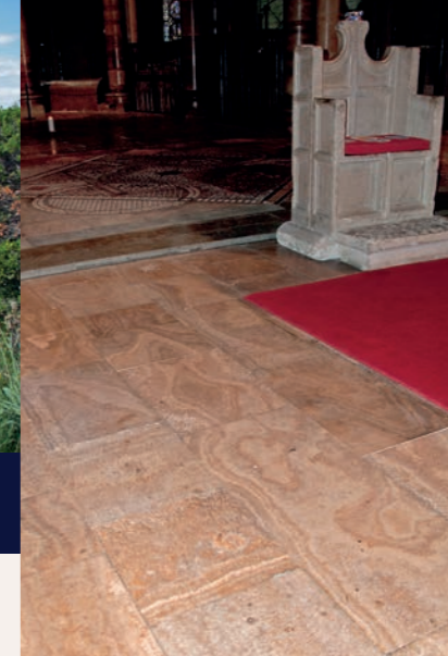
An export success of the middle ages: lime deposit from the Eifel Aqueduct as marble for the floor of the Bishop throne in the Canterbury Cathedral (England)

In the high Middle Ages, the routes used to transport marble from the quarries in northern Italy had deteriorated and were unusable for heavy loads. Thus, north of the Alps, decorative stone became unavailable and architects looked for a substitute material. For churches, monasteries and castles of the romanesque period one exploited the long defunct aqueduct for building material. But of greatest interest were the lime deposits, which skilled stonemasons and sculptors turned into very special marble.