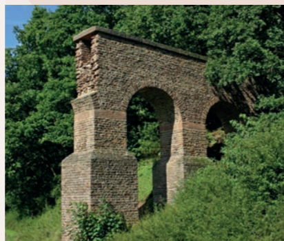
Mechernich-Vusse: reconstruction of an aqueduct bridge based on local finds

It was an archaeological sensation to be able to demonstrate for the first time the subdivision of an antique building project in roughly 5 km long building sections. A well armoured stilling basin connected two such building sections. Spring encasements, bridges, collection basins and sediment basins could be investigated archaeologically to then restore them. When needed, protective housing was designed to display these elements along the “Römerkanal walkway” – one of the first such archaeological oriented routes in Germany.